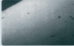
ProStar Welding Wire

Metal fabricators depend on ProStar wire for its twist-free characteristics, exceptional performance and superior consistency.